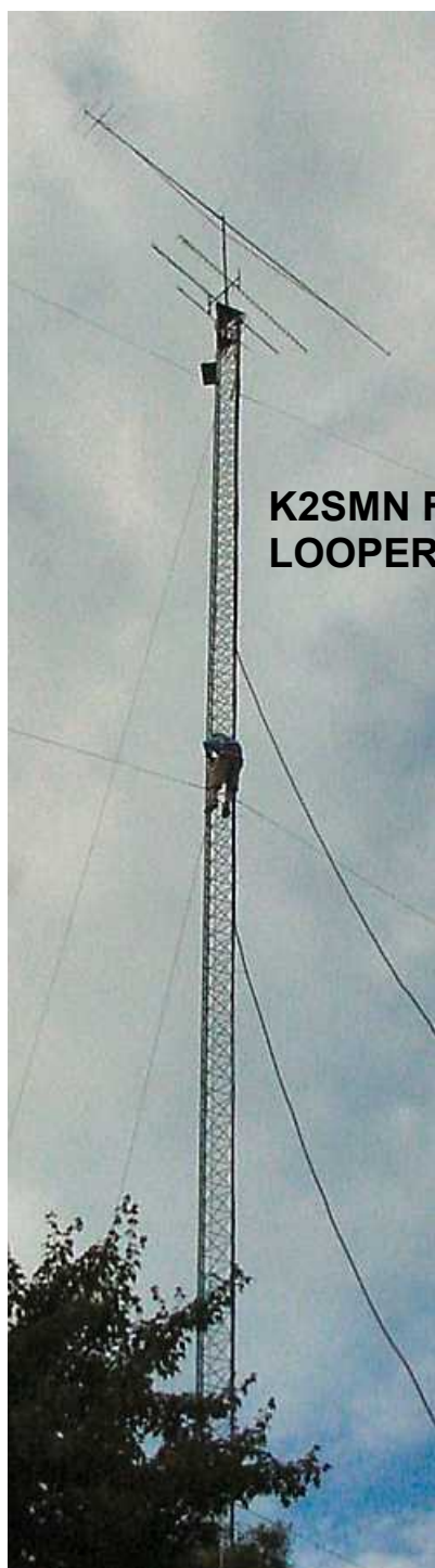
K2SMN FN20 150ft 4218XL & LOOPERS 903-1296-2304